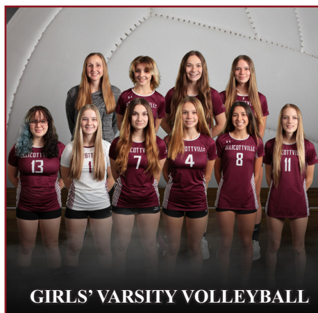
GIRLS' VARSITY VOLLEYBALL