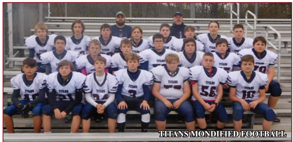
TITANS MODIFIED FOOTBALL