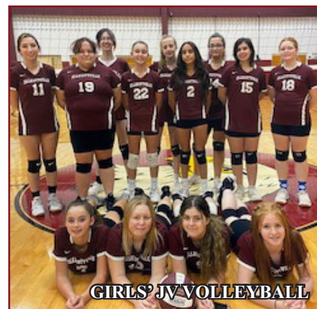
GIRLS' JV VOLLEYBALL

I have high hopes for this team next year. If every single player puts in work in the off-season, come Fall 2022, it will certainly be a team that will be fun to watch.