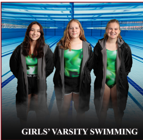
GIRLS' VARSITY SWIMMING