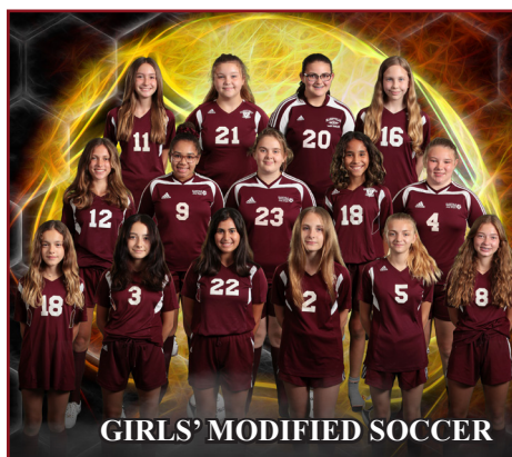
GIRLS' MODIFIED SOCCER