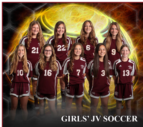
GIRLS' JV SOCCER